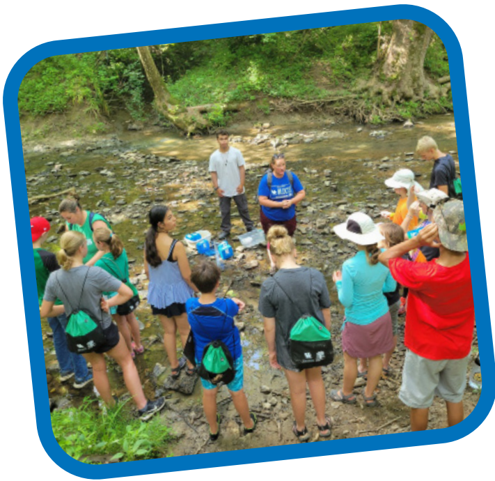
Jr. Master Naturalists learning about water quality.

At the end of the three-day camp, students were placed in teams where each team was given different scenarios they had to complete. Scenarios included fixing injuries, finding safe drinking water, setting up shelters, and making fires. Participants from both programs ended the week with a new appreciation for the outdoors, being more prepared for outdoor adventures, and are taking new skills into their future.