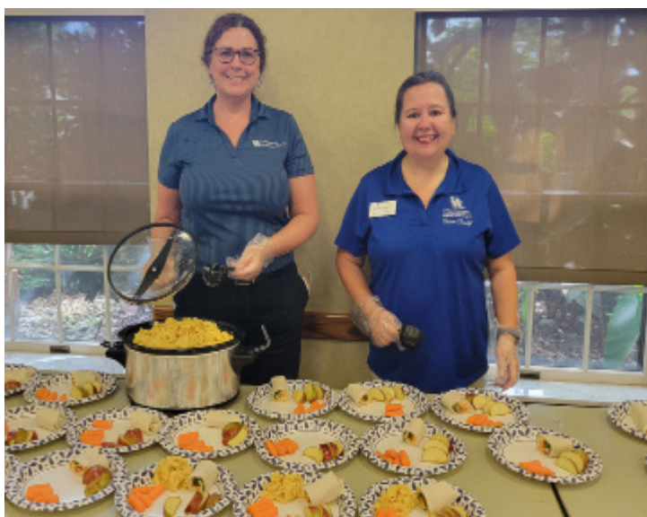
Attendees enjoyed a nutritious meal while planting a pollinator garden at the Boone County Extension Office.

The Boone County Nutrition Education Program Assistants discussed healthy meals while providing a budget-friendly, well-balanced lunch. Participants were able to name multiple examples of pollinators. Educational handouts and pollinator plant seed packs were provided to participants. This program allowed for numerous educational opportunities while also allowing grandparents to spend quality time with their grandchildren.