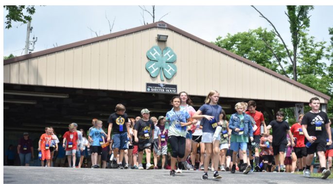
Various campers having a blast at 4-H Camp

During their week at camp, campers are encouraged to make new friends. By the end of the week, everyone was supportive of each other and acting like they have been friends for years (caring citizens).