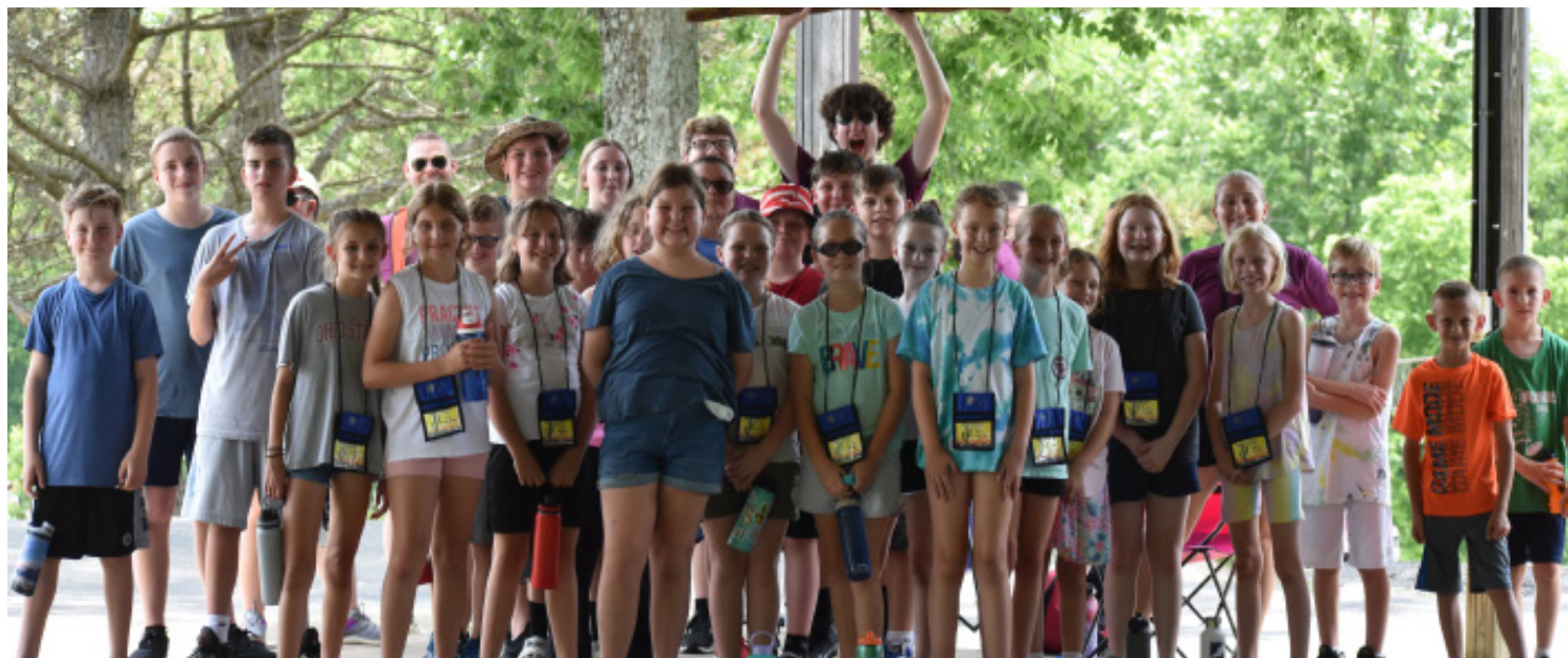
4-H Campers at North Central 4-H Camp