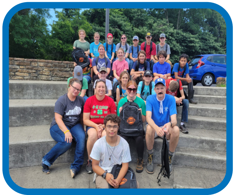
Teen Survival Camp group photo!