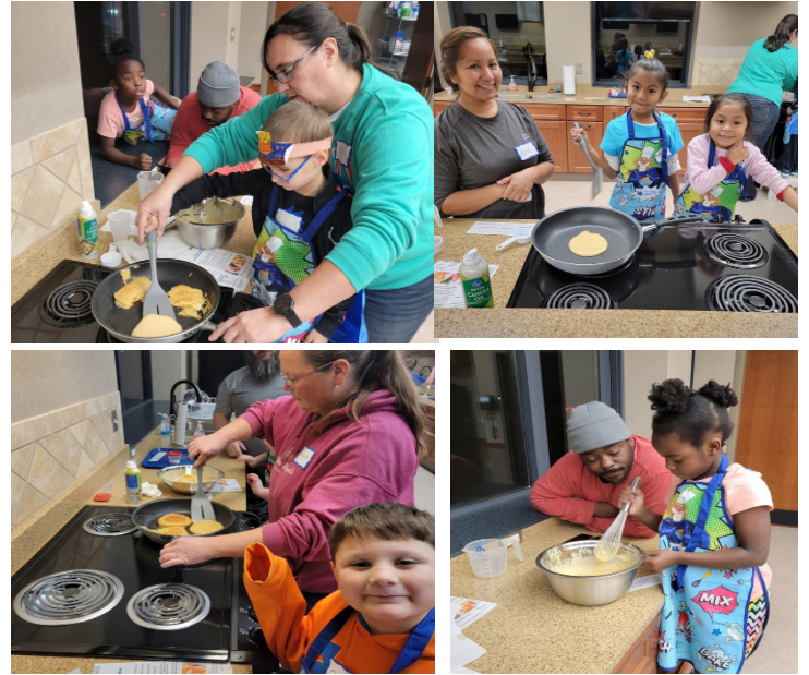
Families from Hillard Collins Elementary School created various recipes at the Enrichment Center cooking lab.

The purpose of this program was to educate families to prepare and plan meals keeping MyPlate in mind, and to promote a positive cooking environment in the kitchen for both the children and adults. These program goals were accomplished successfully! Both adults