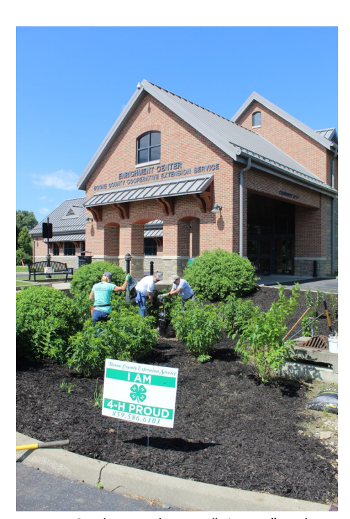
Master Gardener Volunteer "Dig Day" at the Boone County Extension Enrichment Center

▶ January 28, 6:00pm Boone County Enrichment Center This program will be about how to pick the optimum gardening site and what to do with a garden site that may be suboptimal.