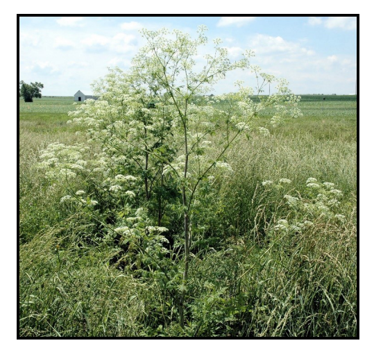
Figure 3. Mature poison hemlock plant.

As the plant begins to send up flower stalks in the spring, the leaves are alternately arranged on the main stem. Each individual leaf is pinnately compound with several pairs of leaflets that appear along opposite sides of the main petiole. As the plant matures, poison hemlock creates a taproot and grows upwards to about 6 to 8 feet tall. At maturity the plant is erect, often with multi-branched stems (Figure 3). Poison hemlock has hollow stems which are smooth with purple spots randomly seen along the stem and on leaf petioles. There are no hairs on the plant that helps distinguish it from other plants similar in appearance. The flowers, when mature, are white and form a series of compound umbels (an umbrella-shaped cluster of small flowers) at the end of each terminal stalk. Poison hemlock can be associated with areas having adequate moisture throughout the year, as well as, drier environments.