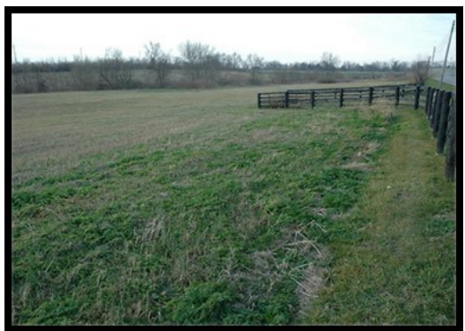
Figure 2. Poison hemlock plants growing along a fence line in late December.

As the plant begins to send up flower stalks in the spring, the leaves are alternately arranged on the main stem. Each individual leaf is pinnately compound with several pairs of leaflets that appear along opposite sides of the main petiole. As the plant matures, poison hemlock creates a taproot and grows upwards to about 6 to 8 feet tall. At maturity the plant is erect, often with multi-branched stems (Figure 3). Poison hemlock has hollow stems which are smooth with purple spots randomly seen along the stem and on leaf petioles. There are no hairs on the plant that helps distinguish it from other plants similar in appearance. The flowers, when mature, are white and form a series of compound umbels (an umbrella-shaped cluster of small flowers) at the end of each terminal stalk. Poison hemlock can be associated with areas having adequate moisture throughout the year, as well as, drier environments.