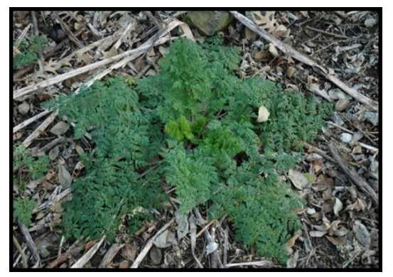
Figure 1. Poison hemlock rosette.

Poison hemlock is classified as a biennial that reproduces only by seed. It is capable, however, of completing its lifecycle as a winter annual in Kentucky if it germinates during the fall months. New plants emerge in the fall or late winter forming a cluster of leaves that are arranged as a rosette on the ground (Figure 1). The individual leaves are shiny green and triangular in appearance. Although poison hemlock is most noticeable in late May and June during the flowering stage of growth, the vegetative growth stage is readily observed during the cooler months of the year (Figure 2) with its parsley-like leaves which are highly dissected or fern-like.